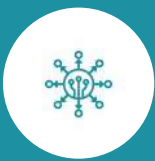
Decentralized Finance (DeFi)