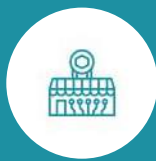
NFT & NFT Marketplace