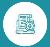
Token & Smart Contract