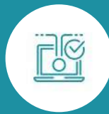
Crypto Payment Gateways