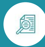
Smart Contract Audit