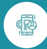
Decentralized App (dApp)