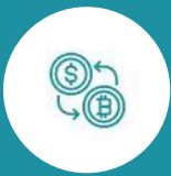
Crypto Exchange (DEX & CEX)