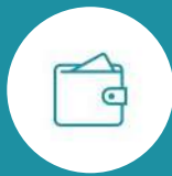
Crypto Wallet & Custody