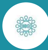
Crowdfunding Platform Creation (IDO/ICO/STO)