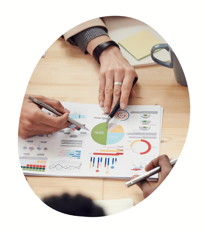
ZERO SETUP COST THROUGH A TURNKEY SOLUTION