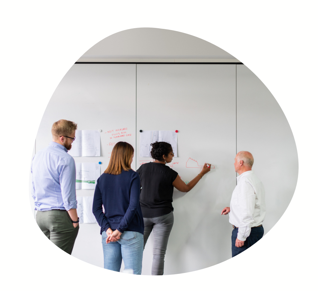
DEDICATED DEVELOPMENT TEAMS